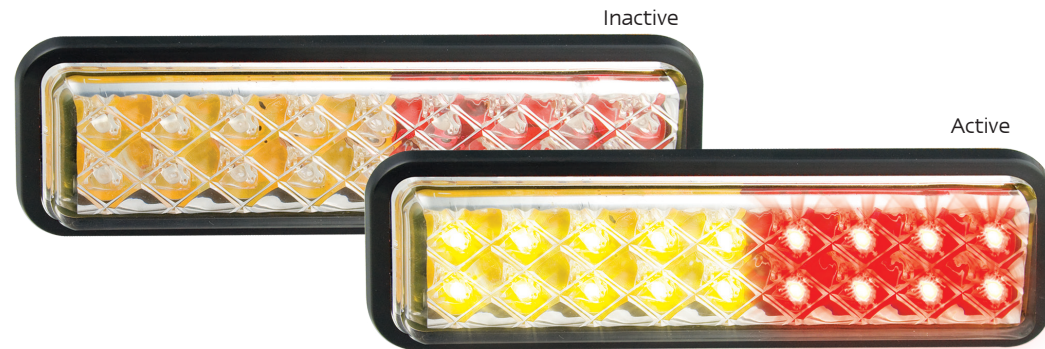
Stop/Tail/Indicator - Recessed Mount 135ARMG - Single Blister