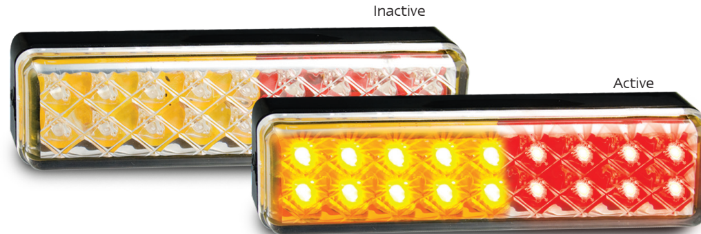
Stop/Tail/Indicator - Surface Mount 135ARM - Single Blister 135ARM/2 - Twin Blister